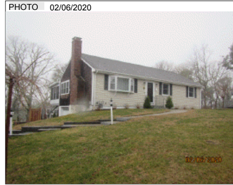
PHOTO 02/06/2020 BLDG COMMENTS LLF=FAM RM/PLAY RM/OFFICE/BATH (PER PLANS)