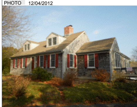
PHOTO 12/04/2012 BLDG COMMENTS LLF 328 OFFICE--PETER MCINTIRE & SONS EXCAVATING & OUT BUILDINGS/SOLAR PANELS