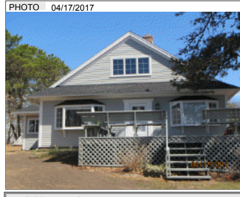
PHOTO 04/17/2017 BLDG COMMENTS PULL DOWN STAIR ATTIC