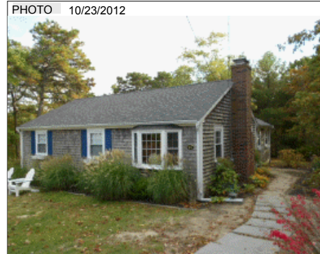
PHOTO 10/23/2012 BLDG COMMENTS BMF=2BDRMS,1F.BATH,M INTERIOR IS SUPERIOR TO EXTERIOR