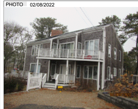
PHOTO 02/08/2022 BLDG COMMENTS 19 SOLAR PANELS