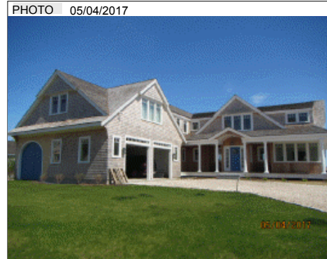
PHOTO 05/04/2017 BLDG COMMENTS GFP=OUTSIDE, LLF=3RMS, 1FBTH, 2EX.FIX