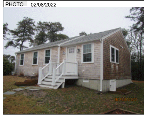
PHOTO 02/08/2022 BLDG COMMENTS INTERIOR ESTIMATED PER PLANS 7/1/2021