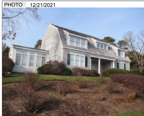
PHOTO 12/21/2021 BLDG COMMENTS