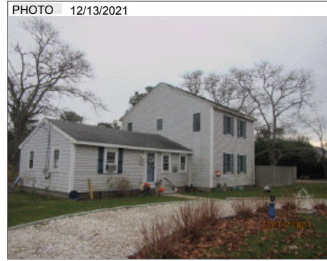
PHOTO 12/13/2021 BLDG COMMENTS