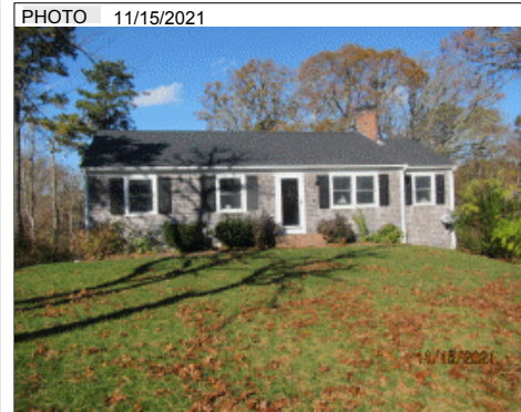
PHOTO 11/15/2021 BLDG COMMENTS INFO @ DOOR 11/15/21/ 8/24=LLF-1BDRM, OFFICE AREA