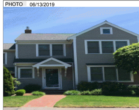
PHOTO 06/13/2019 BLDG COMMENTS UNIT 23 - BLDG 3