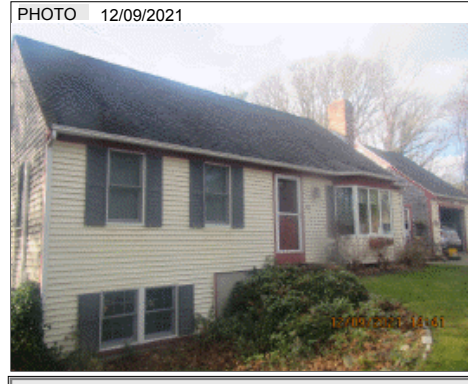
PHOTO 12/09/2021 BLDG COMMENTS