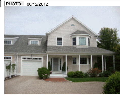
PHOTO 06/12/2012 BLDG COMMENTS UNIT 6 BLDG 4 ALSO GARAGE 6E-14D-XD